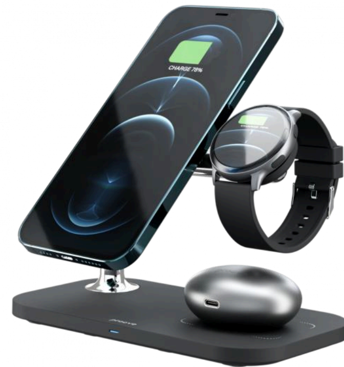
WIRELESS MAGNETIC CHARGERS